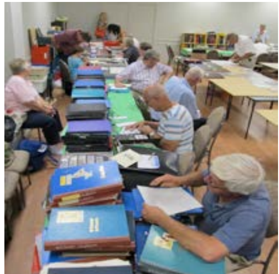
Scenes from the combined Manly-Warringah clubs' successful New Year's Stamp Fair in January.