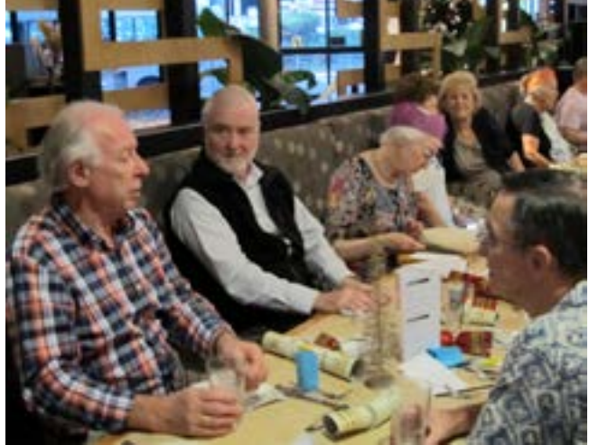
Members of the Club Willoughby and Manly-Warringah Rugby League Club stamp clubs enjoy a Christmas meal at the Rugby League licensed club.