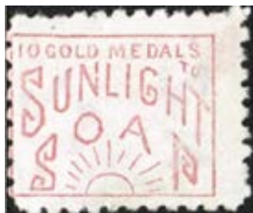
New Zealand 1893 'Second Sideface' stamp with advertising on the back.

*** Saturday 13th December End of Year social afternoon, 1:00 pm ***