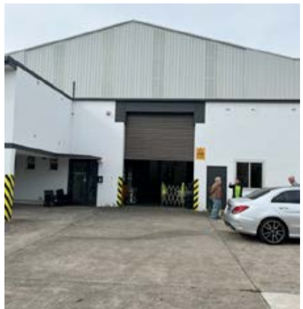
Our building at Silverwater