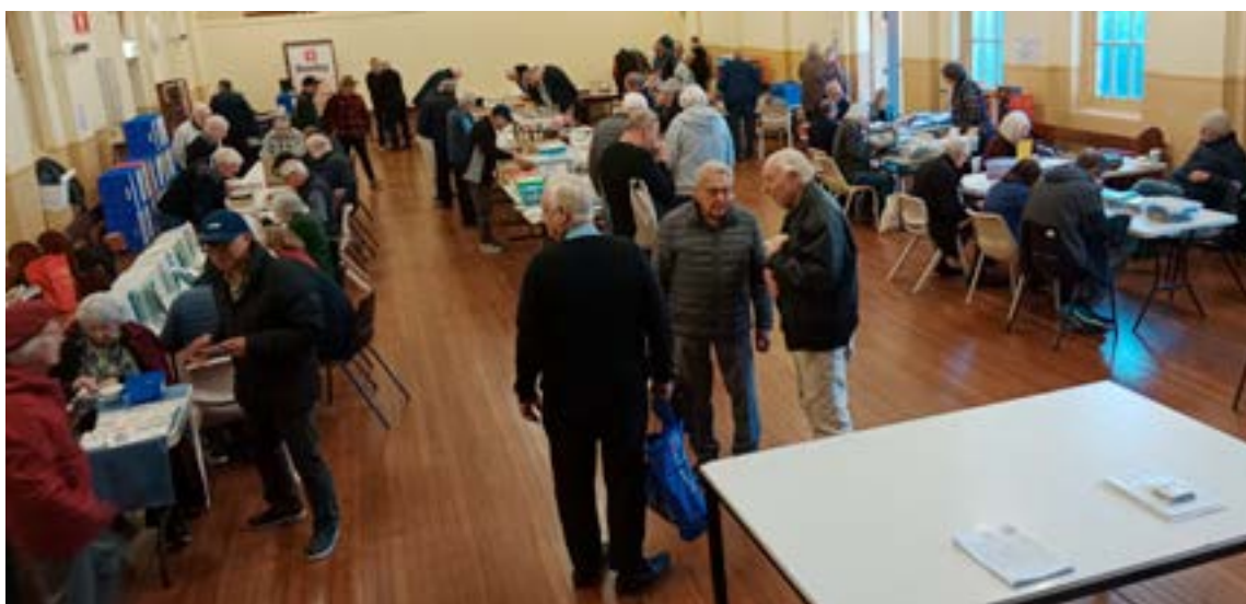
The event drew a good crowd as usual (above). The auction was the the major drawcard (below)