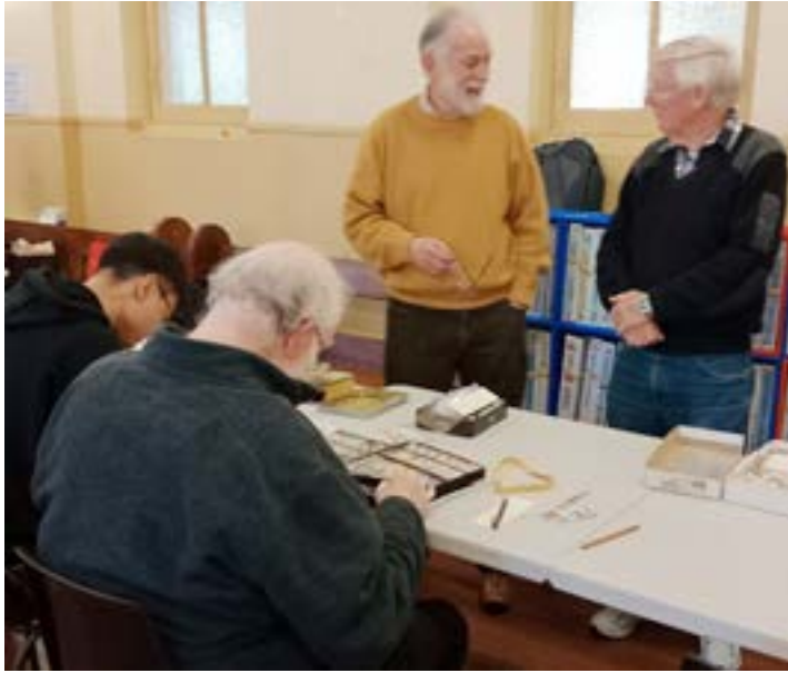
The Sydney Anglicans had their usual wide variety of material.