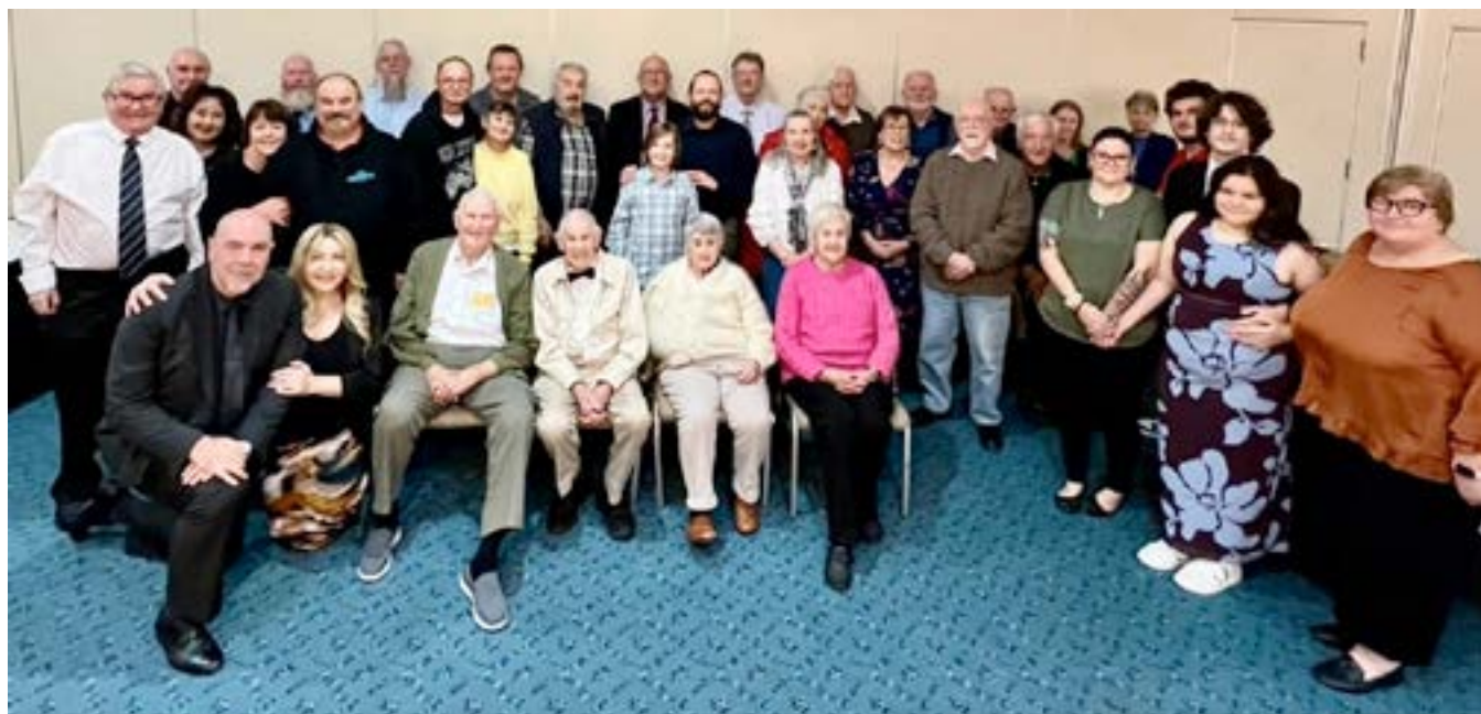
Illawarra Society's members and guests at their 80th anniversary dinner.

As guests filed out, clutching their commemorative covers and basking in the afterglow of good company, one thing was clear: the Society's greatest treasure is not found only in rare stamps, but in the bonds forged and memories made together through the love of philately. Here's to many more years of collecting, connecting, and celebrating all that stamps can represent.