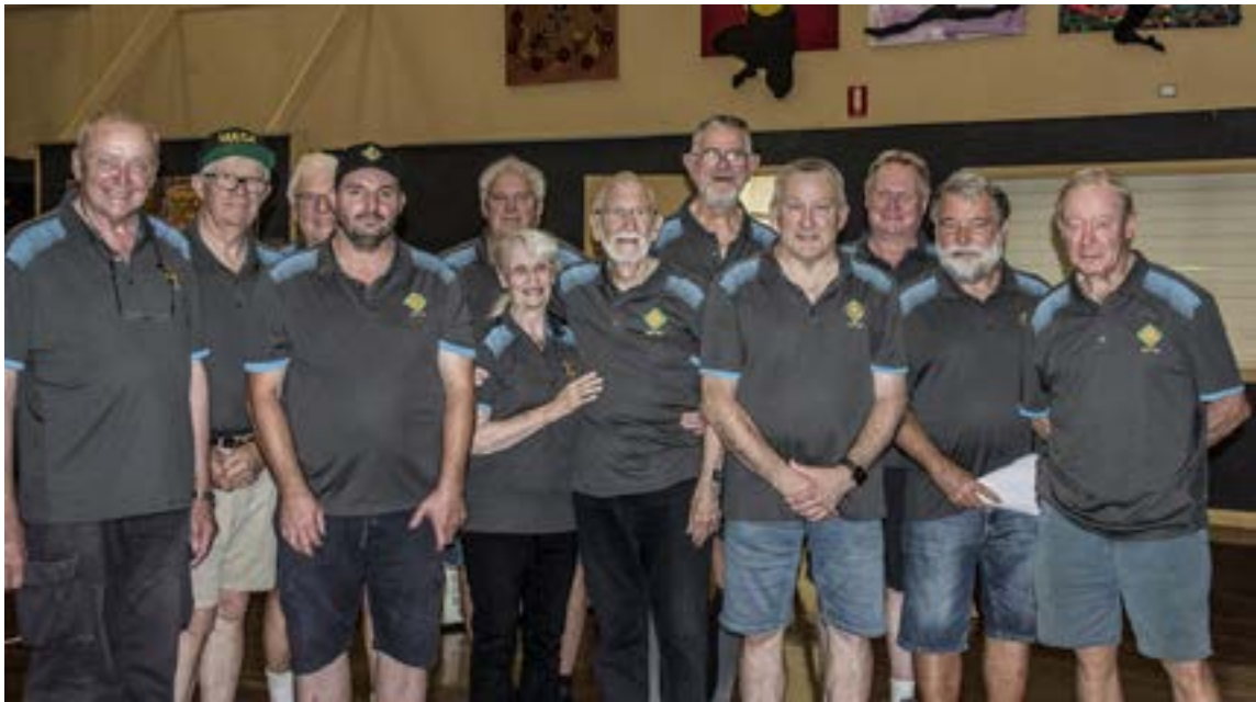
Club members at Orange Expo on 16 March in their new "60 Years" Club T-shirts.